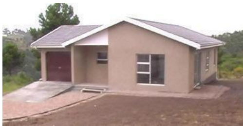
Final and Occupancy