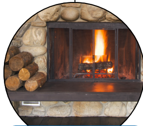
FIREPLACES AND FIREPLACE INSERTS

What heating equipment in my home can cause fires?